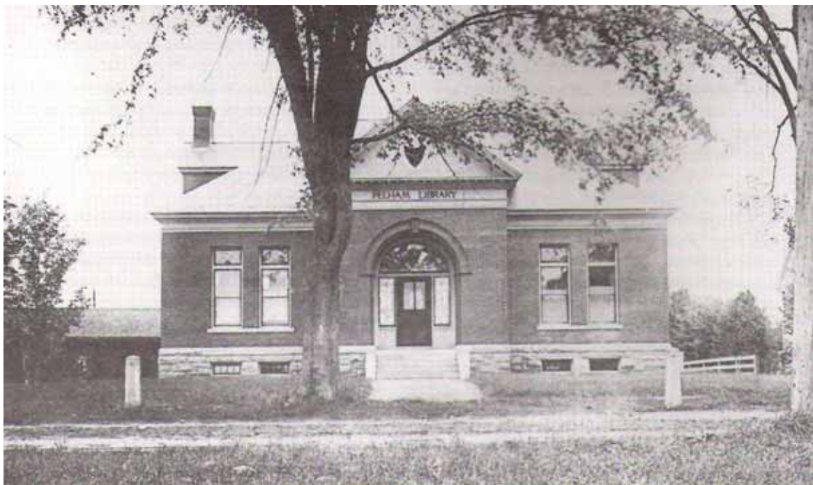
Pelham Library and Memorial Building, ca. 1903, looking north at front elevation.

Reprinted in 250 th Souvenir Book (1996).