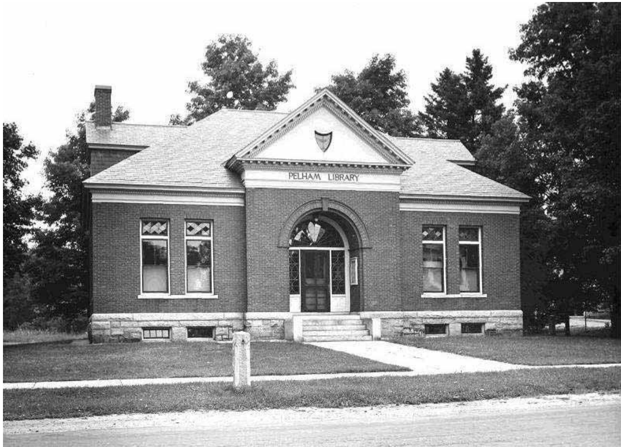
Undated (ca. 1940s) photograph of the façade of the Pelham Library and Memorial Building.