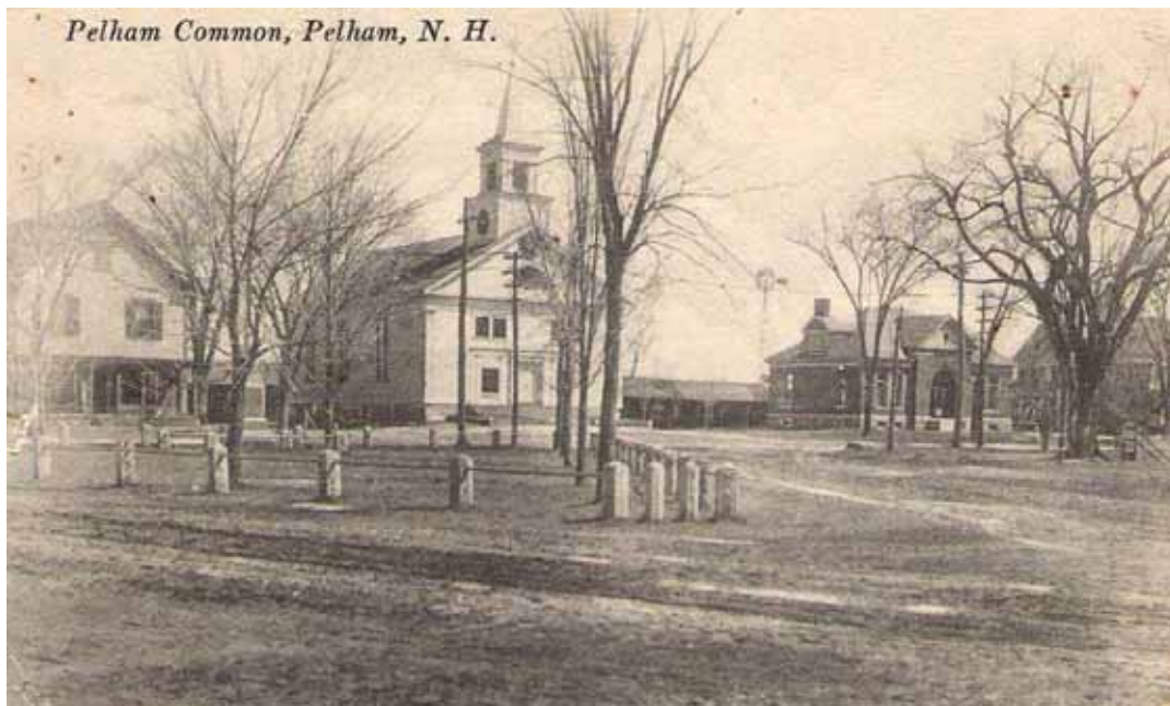
"Pelham Common," ca. 1900. Looking northeast, showing, from left: Atwood's Store, the Congregational Church with horse sheds behind, and the Library and Memorial Building. The Town Common makes up the foreground.