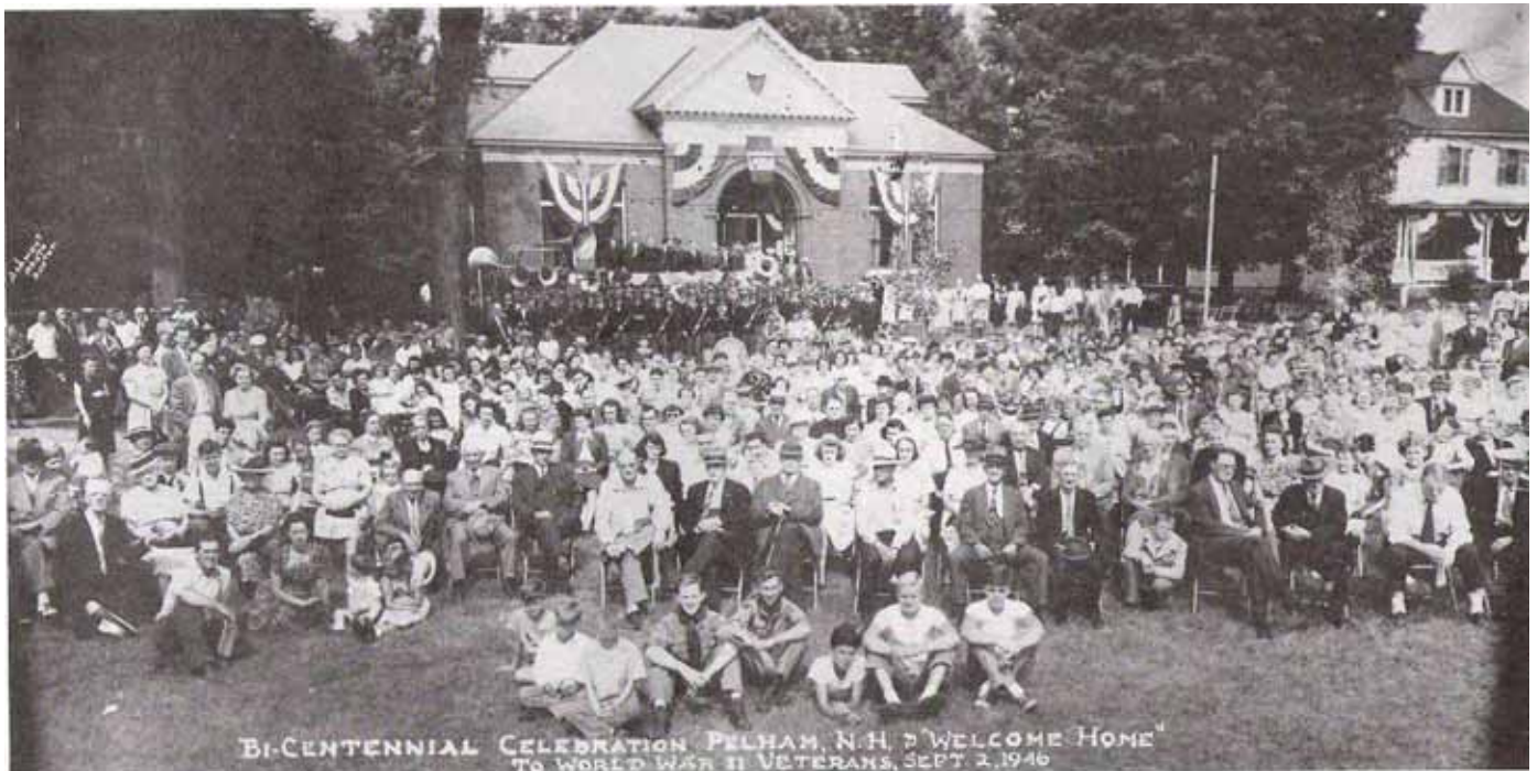
"Bi-Centennial Celebration of Pelham, N. H. and Welcome Home to World War II Veterans, Sept. 2, 1946." Showing the Pelham Library and Memorial Building as part of the event venue. Reprinted in the 250 th Souvenir Book (1996).